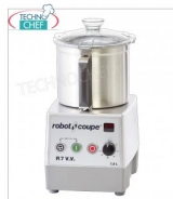
Table CUTTER R7 VV, tank capacity lt.7.5, ROBOT COUPE brand, professional

Table CUTTER R7 VV, ROBOT COUPE brand, with 7.5 liter removable STAINLESS STEEL BOWL, Variable speed from 300 to 3500 rpm, V. 230/1, Kw 1,5, Weight 23 Kg, dimensions 280x350x520h mm