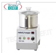
Table CUTTER R5 VV, tank capacity lt.5,9, ROBOT COUPE brand, professional

Table CUTTER R5 VV, ROBOT COUPE brand, with removable STAINLESS STEEL BOWL of 5.9 liters, Variable speed 300 / 3,500 rpm, V. 230/1, Kw 1,50, Weight 22 Kg, dimensions 280x350x490h mm