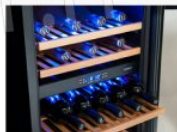
Griglie in legno