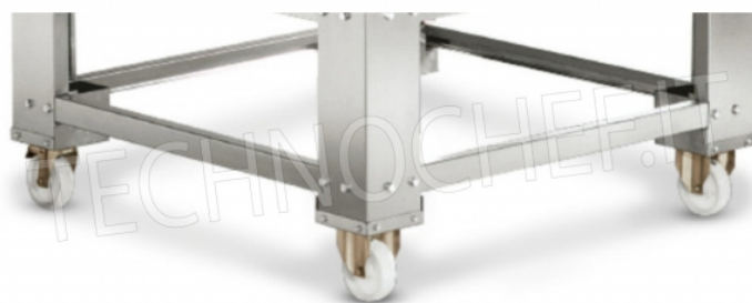
KIT 4 RUOTE (2 CON FRENO)