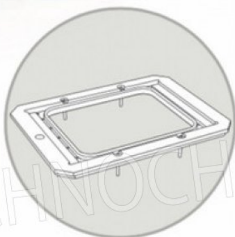
STAMPO GN 1/2 mm 265x320 MOULD GN 1/2 mm 265x320