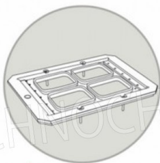
STAMPO GN 1/8 mm 160x130