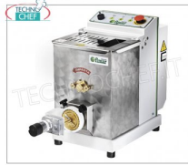
Table-top EXTRUDED PASTA machine - with tank for 4 kg of dough, hourly output 13 kg, complete with: ELECTRONIC PASTA CUTTER, V.400/3, Kw 0.75, weight 42 kg, dimensions mm 350x760x450h