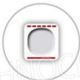
Barra saldante aggiuntiva Extra Sealing Bar