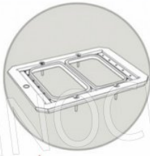
STAMPO GN 1/4 mm 265x160 MOULD GN 1/4 mm 265x160