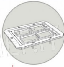
STAMPO GN 1/8 mm 160x130 MOULD GN 1/8 mm 160x130