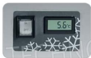
Comandi TC ICE TC ICE controls