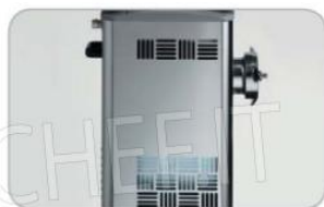
Griglie di ventilazione TC ICE TC ICE airing take