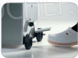
Ritorno pistone automatico