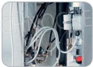
Particolare centralina e comandi