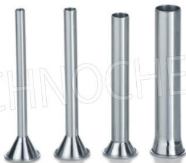
Imbuti inox (ø 13-16-20-25-28-38) opzionali