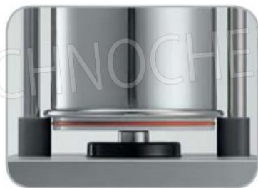
Guarnizione ermetica su cilindro oleodinamico