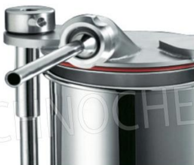
Ghiera inox opzionale