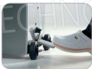
Azionamento spinta pistone