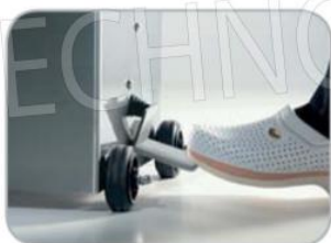
Azionamento spinta pistone