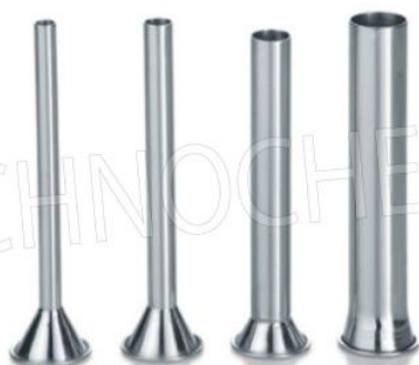
Imbuti inox (ø 13-16-20-25-28-38) opzionali