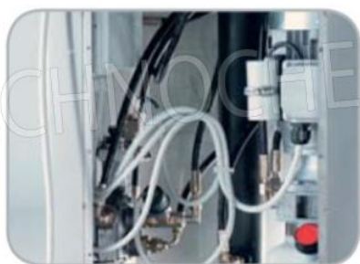
Particolare centralina e comandi