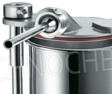
Ghiera inox opzionale