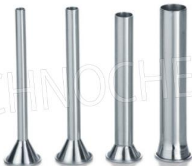
Imbuti inox (ø 13-16-20-25-28-38) opzionali