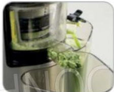
Vaschetta per gli scarti Tray for waste