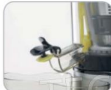
Tappo salvagoccia Drip cap