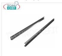
Forcar - Driving Couple Pair of trays for trays