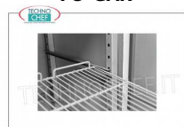
Forcar - Pair of anti-tilt guides Pair of anti-tilt guides for grill