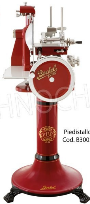
Piedistallo Cod. B300STAND (Optional)