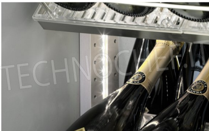
Illuminazione a LED integrata con colore naturale e Ambra (optional)