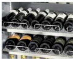
I ripiani in policarbonato e acciaio inox sono posizionabili a diverse altezze e reclinabili, è sufficiente spostare le viti con cui sono fissate alla barra centrale.