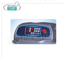
DIGITAL CONTROL PANEL Digital control panel