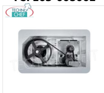
SPIRAL TRANSMISSION with TRANSMISSION Spiral transmission with return (no for code TCF163-003400).