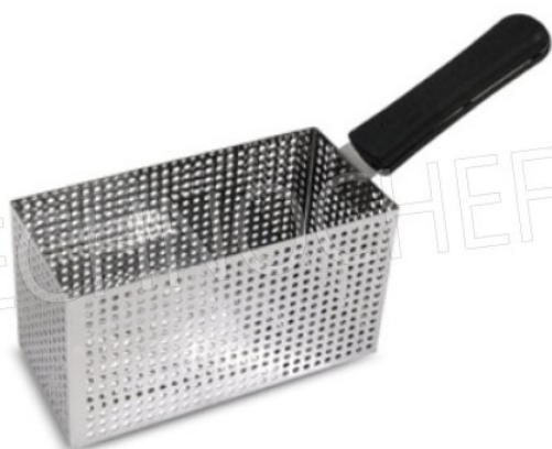
Cesto maxi opzionale