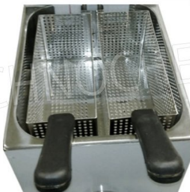
Cesto maxi opzionale