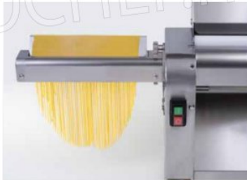
Tagliolino con passo regolare