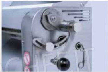
Sistema di regolazione micrometrico ad ingranaggi con indicatore di apertura e chiusura rulli