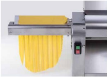
Pappardelle (lasagnette) con taglio a passo irregolare come se fossero tagliate a mano