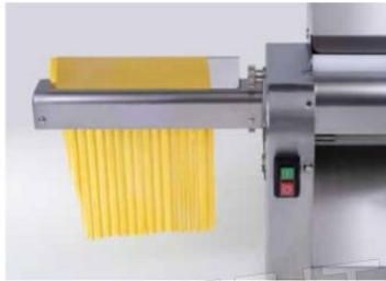
Tagliatelle (fettuccine) con taglio a passo irregolare come se fossero tagliate a mano