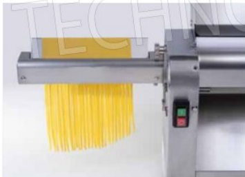
Trenette con taglio a passo irregolare come se fossero tagliate a mano