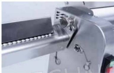
Sistema rapido di aggancio e sgancio accessori tagliasfoglia