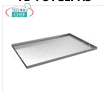
Aluminum Pastry Tray Aluminum tray for pastry (mm 600x400)