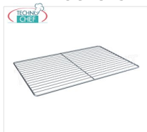
Chrome Pastry Grid Chromed grill for pastry (mm 600x400)