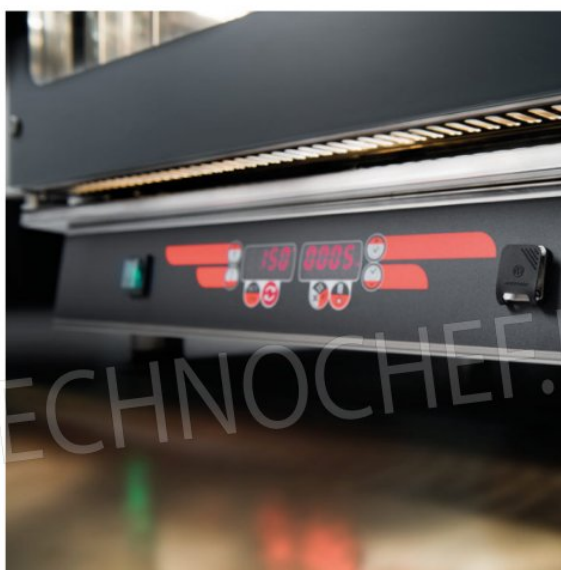
Pannello di controllo digitale