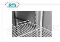
Forcar - Pair of anti-tilt guides Pair of anti-tilt guides for grill