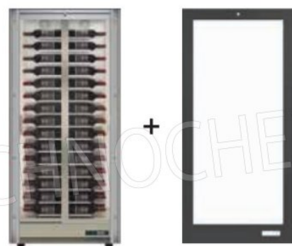
TV-H10 / TE-H10