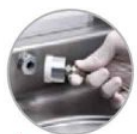
Connessione per attacco gastrovac Connection for the gastrovac system