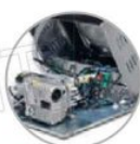
Carter apribile a 90° 90° openable carter