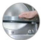
Barre saldanti estraibili Removable sealing bars