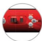
Pannello digitale Digital panel

STANDARD FUNCTION ONLY FOR CHAMBER MACHINES