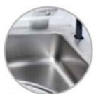
Vasca inox con angoli stondati senza saldature Entirely printed stainless steel vacuum chamber, with internal round corners