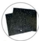
Set tavole di riempimento in polietilene Polyethylene filling squares set