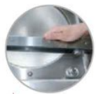
Barre saldanti estraibili Removable sealing bars