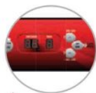
Pannello digitale Digital panel

STANDARD FUNCTION ONLY FOR CHAMBER MACHINES