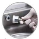
Connessione per attacco gastrovac Connection for the gastrovac system