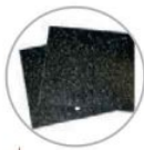
Set tavole di riempimento in polietilene Polyethylene filling squares set