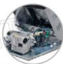
Carter apribile a 90° 90° openable carter