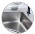
Vasca inox con angoli stondati senza saldature Entirely printed stainless steel vacuum chamber, with internal round corners